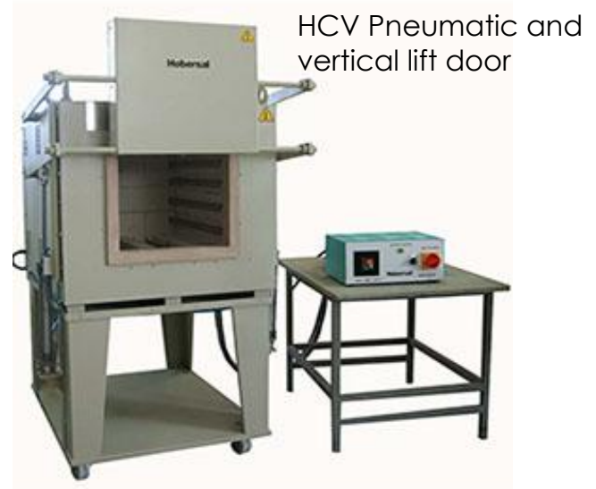
HCV Pneumatic and vertical lift door