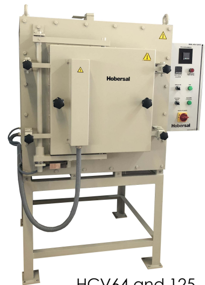
HCV64 and 125