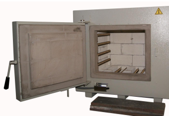
Bogie Hearth Furnace