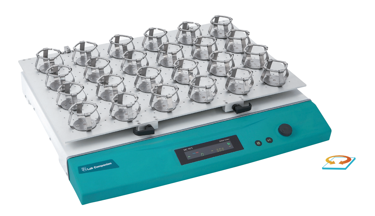
SKC - 7075

Specially designed to carry out heavy-duty and trouble-free operations continuously.