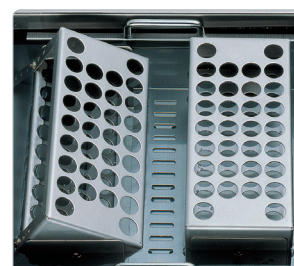
Test Tube Racks