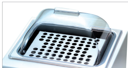
Transparent polypropylene gable covers