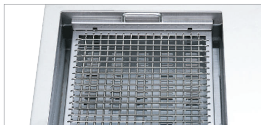
Spring wire racks (two tier rack with flexible crossed spring)