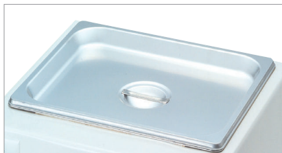
Stainless steel flat covers