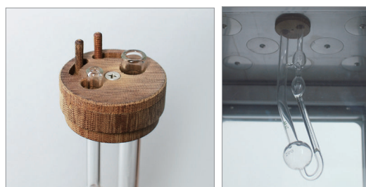
Viscometer tube holders