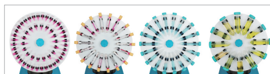
Tube holders (1.5ml / 5ml / 15ml / 50ml)