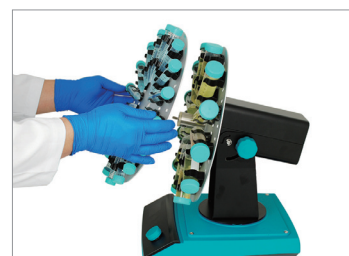
Max. mountable tubes when double stacking