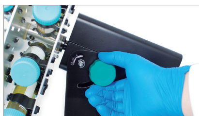
Fully adjustable angle