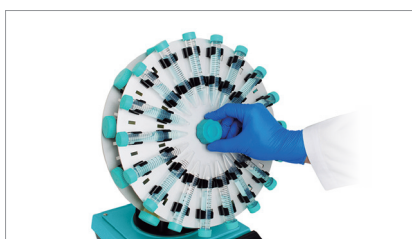
Quick installable and removable disk (optional)