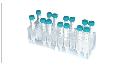
15ml Conical tube rack