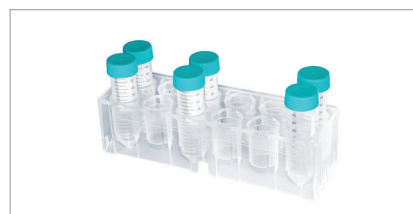
50ml Conical tube rack