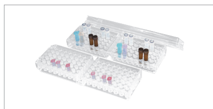
1.5ml Micro-tube rack